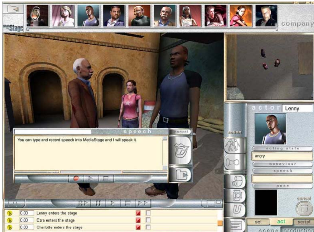
Figure 3: A screenshot from Immersive Education's MediaStage

synchronised characters. This example of practice is particularly notable as it foregrounds the diegetic dimension of the framework so well. The tool allows the learner to build their own 'virtual world' (Woolley, 1992) using staging tools to create the setting (mise-en-scene), characters and dialogue (Figure 3).