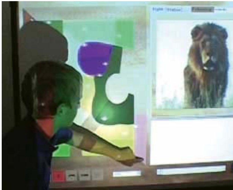
Figure 4: Screen shot from Nesta Futurelab's Savannah adventure game

This second example illustrates how the framework can be used retrospectively to analyse educational practice. Savannah is a mobile strategy adventure game pilot combining the use of virtual and real spaces, mobile technologies and interactive whiteboards to provide a tool for supporting exploratory learning in 11-12 year olds (Facer et al. 2004).