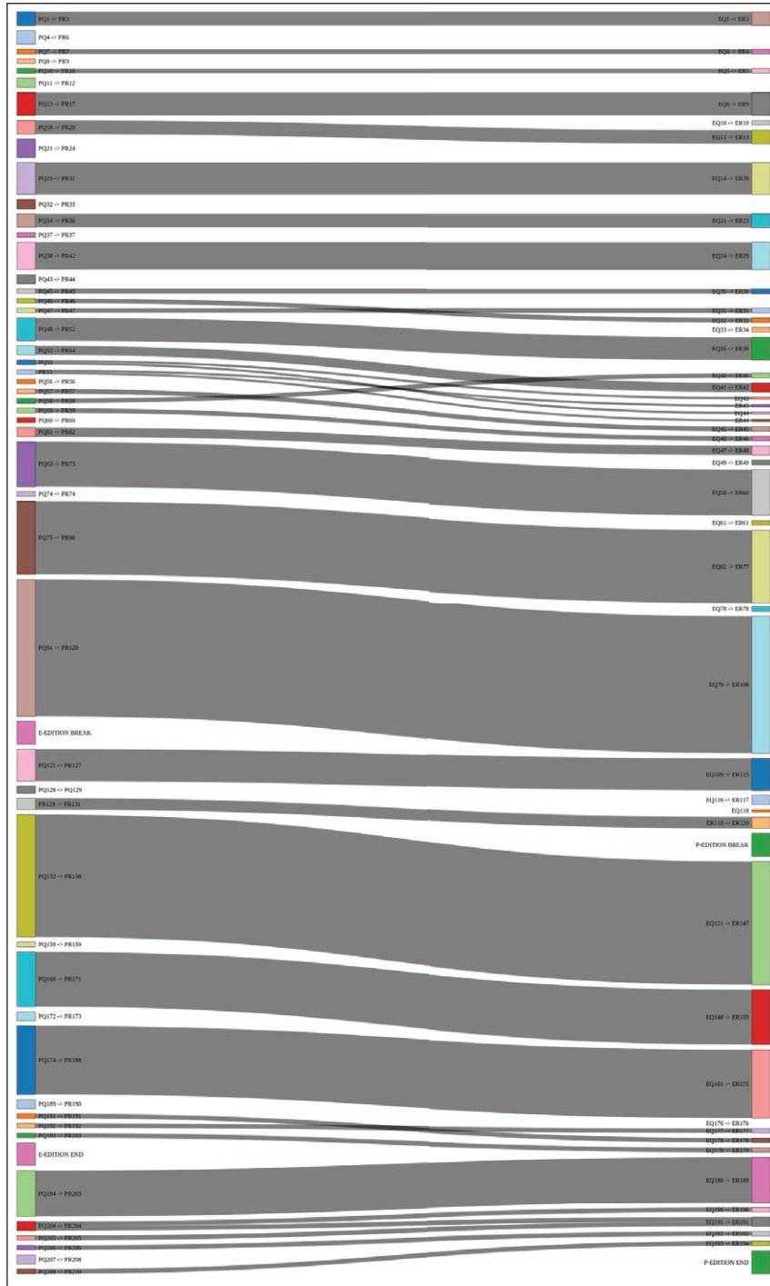
Figure 2: Visualisation of the syuzhet re-ordering between the E edition and P edition of Cloud Atlas .