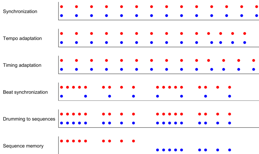
Figure 1. Schematics displaying typical stimuli and ideal responses for all six rhythm tests. For the timing adaptation and tempo adaptation tests, the size of the largest shifts has been doubled for display purposes.