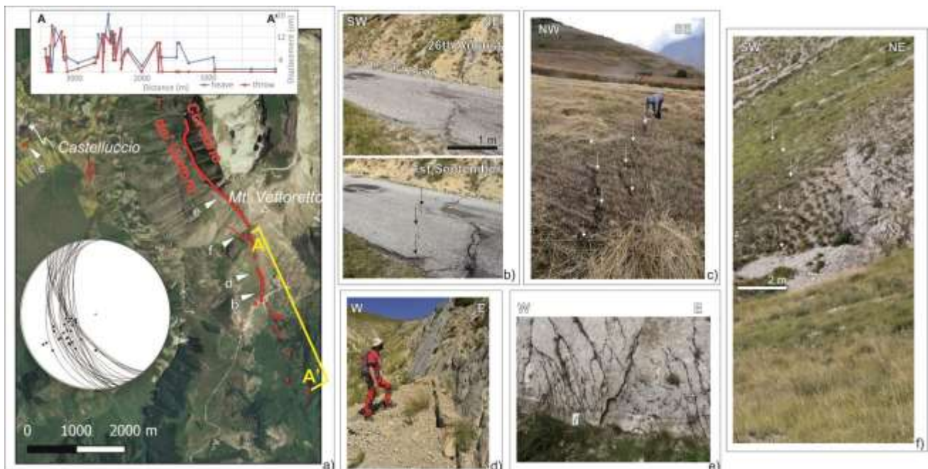
Figure 2: a) map showing of the Mt. Vettore fault area with mapped ground breaks (in red): structural data (displacement vectors and great circles for bedrock faults) and displacement profiles are also reported - Google Earth base image (8/9/2010); b - f) examples of ground breaks: note the typical right-stepping en-echelon pattern and the post-seismic movement documented in b).

A set of ground ruptures was mapped in the southern sector of the Vettore fault, along the the E slope of Mt. Vettore (Fig. 2a A-A' sector). These ruptures show normal movement (slip vector ca. N240) with a minor left-lateral component, strike ca. N150, and commonly show en-echelon right-stepping. Data on recorded displacement are reported in Figure 2a. Ground breaks run continuously, from the road SP34 (Fig. 2b) at the south end, up to the end of Mt. Vettore slope, where the ruptures bend slightly downslope,