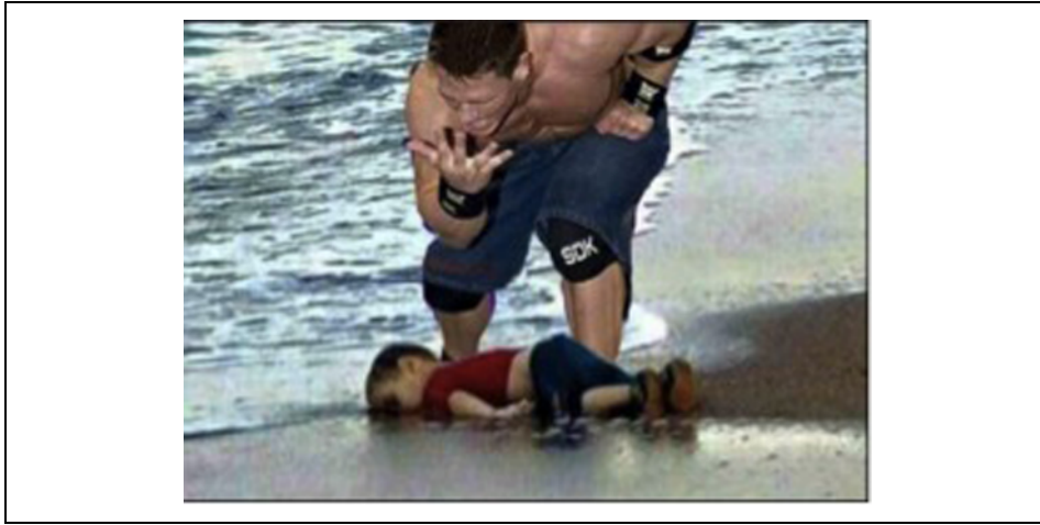
Figure 4. Available at: http://imgur.com/3UWguQf .