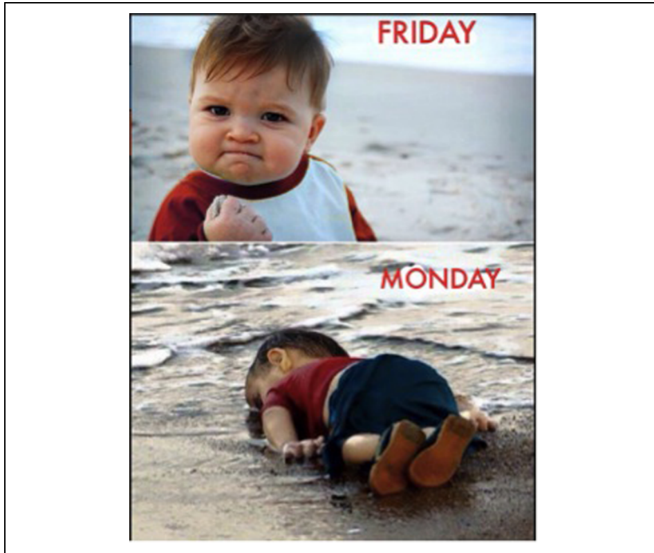
Figure 2. Available at: http://imgur.com/HuHCikC .