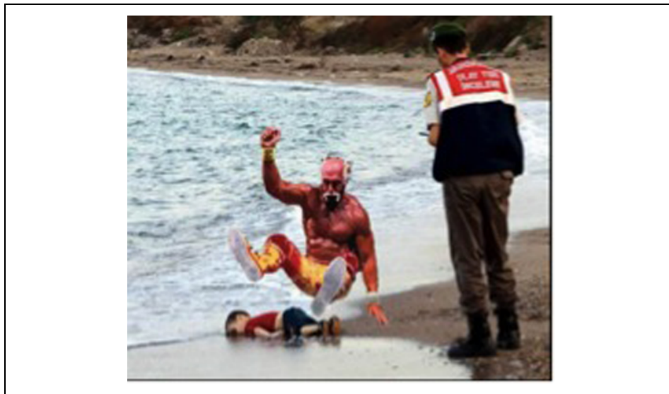
Figure 3. Available at: http://imgur.com/BjtTSvB .