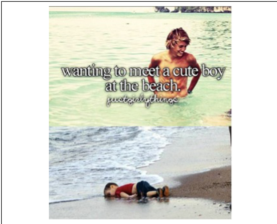
Figure 5. Available at: http://i.imgur.com/bts3rPY.png .

On one hand, this exchange shows that the racist nationalism on the subreddit was not universal, and perhaps that some users were unaware that the humor cloaked other agendas. On the other hand, it is also an