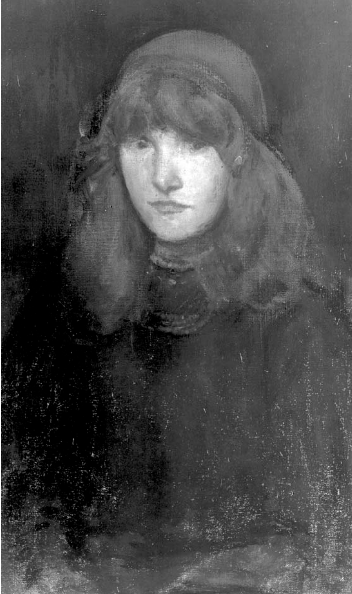
Fig. 2. James McNeill Whistler, Grenat et Or—Le Petit Cardinal , 1900–01. Oil on canvas.