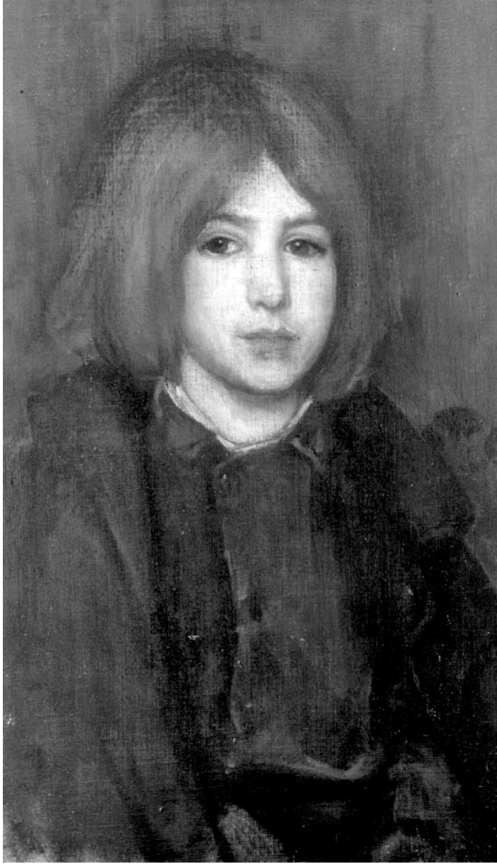
Fig. 1. James McNeill Whistler, Brun et Or—De Race, 1896-1900. Oil on canvas.