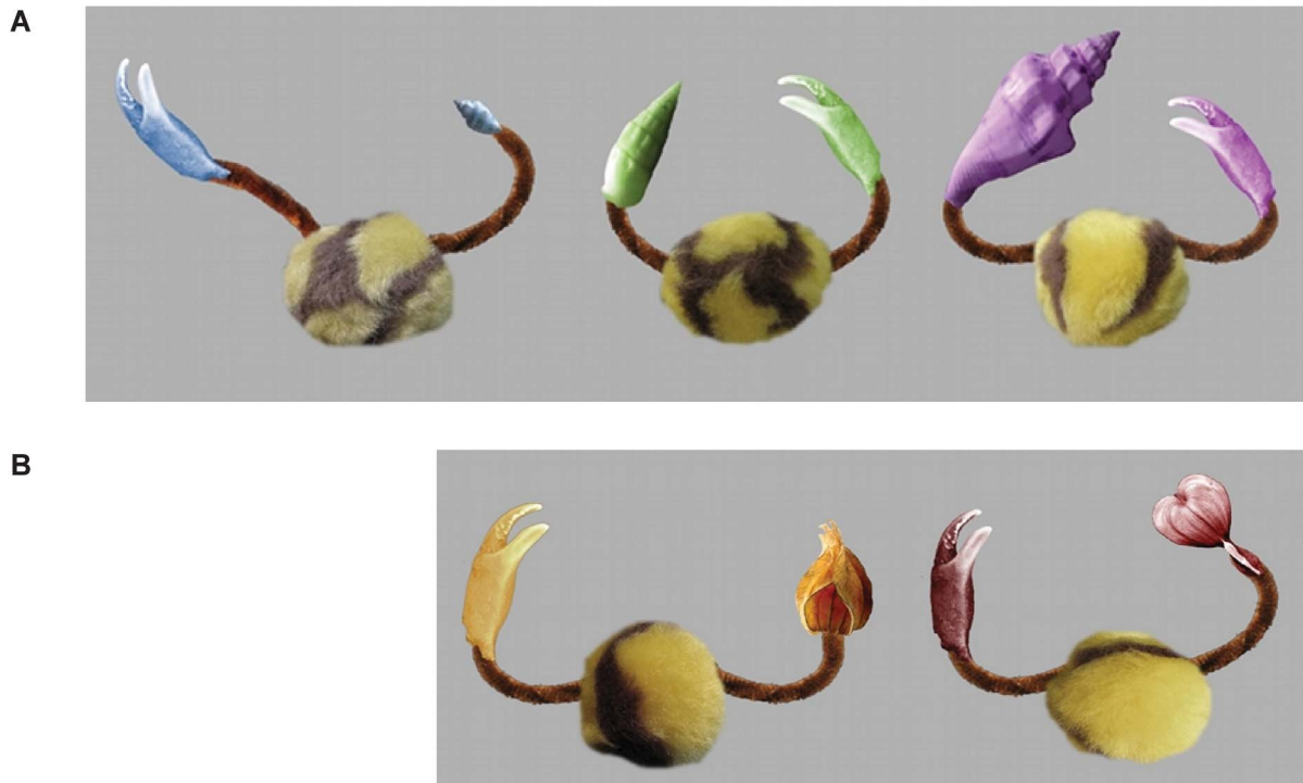
Figure 1. Stimuli. Panel A shows examples of familiarization stimuli, and panel B examples of out-of-category test stimuli. doi:10.1371/journal.pone.0099670.g001

is at the beginning of visual exposure that the impact of labels can be observed.