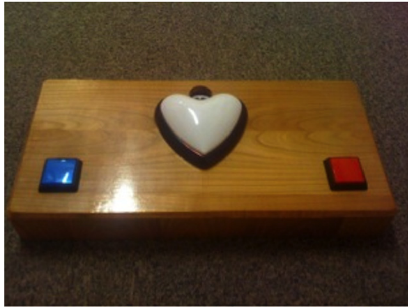
Fig 1. The experimental apparatus.