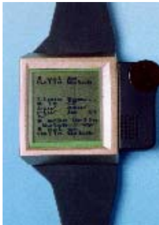
Figure 1: The IBM Linux Watch (Version 1) by IBM Research. Image reproduced by kind permission of IBM research.

( www.research.ibm.com/WearableComputing/factsheet.html )