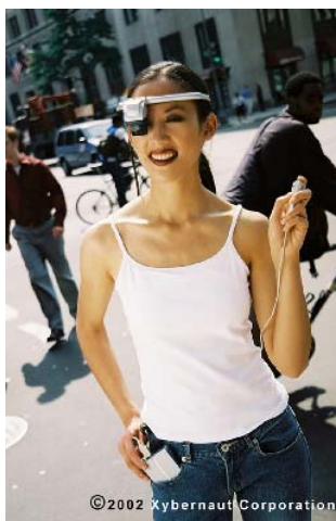
Figure 2: The Xybernaut Mobile Assistant. Courtesy of Xybernaut Corporation.

( www.xybernaut.com/Solutions/product/mav_product.htm )