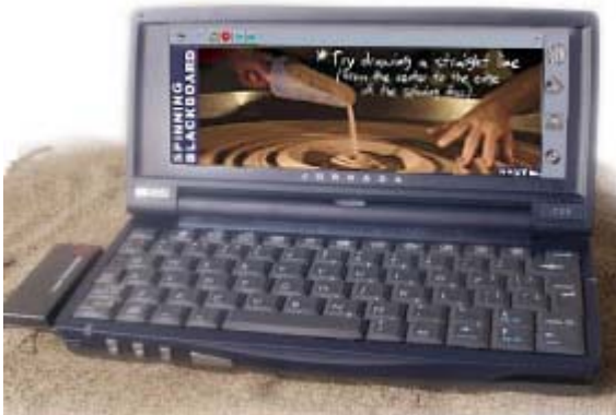
Figure 9: Electronic Guidebook.

The Rememberer , a tool for recording museum visits, is part of the Electronic Guidebook project at the San Francisco Exploratorium, which is investigating the use of handheld devices to enrich learning experience for museum visitors. An important goal of the project is to allow both individuals and groups of visitors a continuum of activities before, during and after the visit, to create an