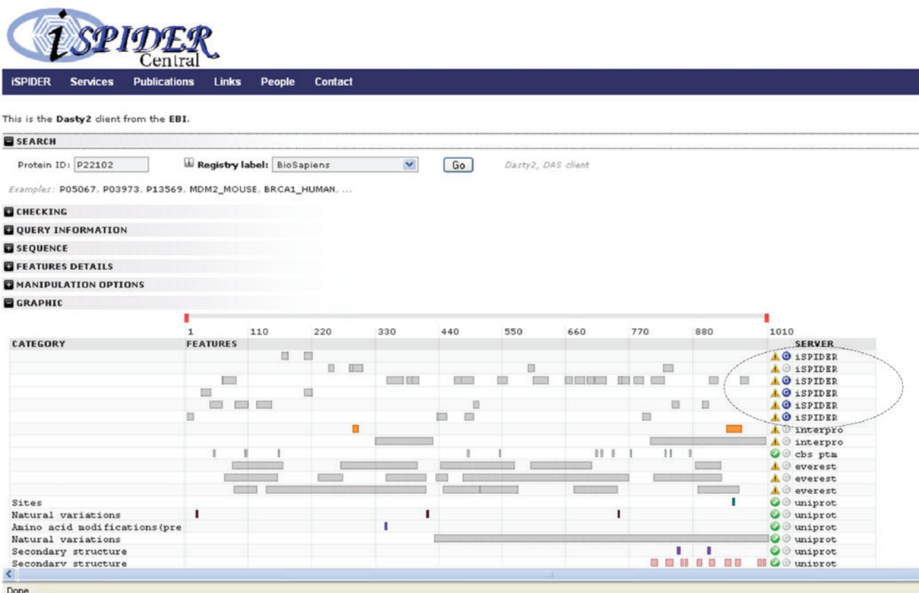
Figure 4. Dasty2 client displaying the ISPIDER search results. Results from an ISPIDER query may be linked out to the Dasty2 client, which shows peptide identifications in line with other annotations.

as secondary structure, disorder prediction (24) and post-translational modifications.