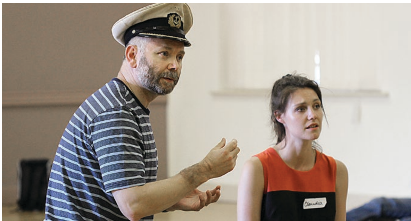
Llanymech Amateur Dramatics Society rehearses Twelfth Night (2016), courtesy of the company

does speak to an important point, which is that Open Stages functioned differently in different regions.