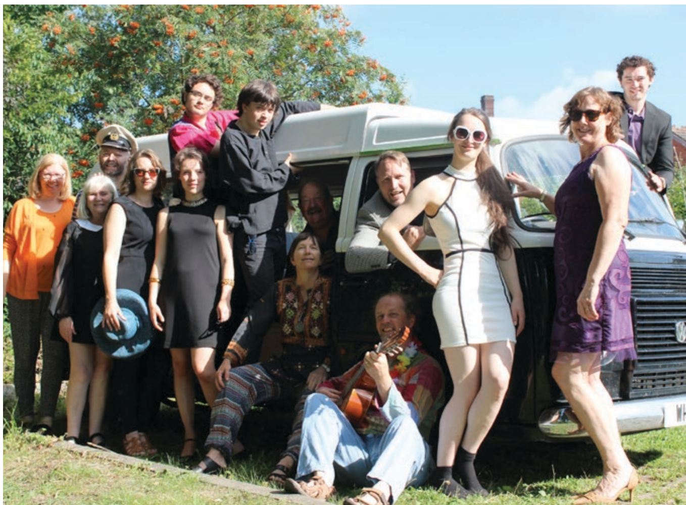
Twelfth Night at Llanymech Amateur Dramatics Society (2016)