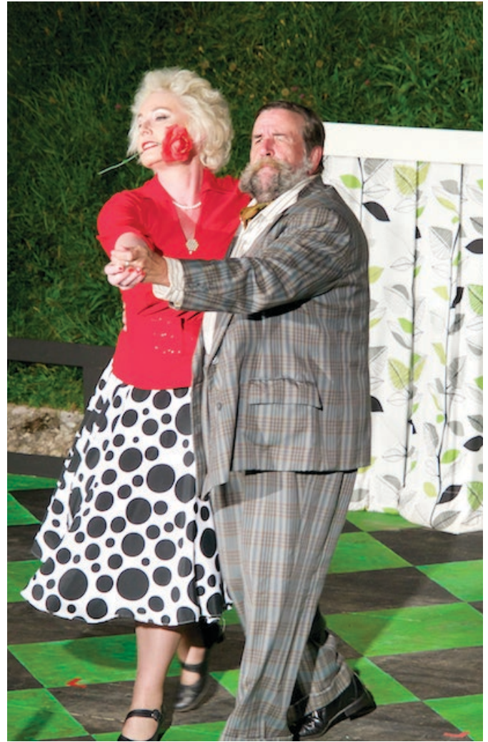
Merry Wives of Windsor at The Inn Theatre Company in Dartmouth

Open Stages places skills development at the heart of the initiative with the expectation that each amateur production selected for the programme will contain ‘some genuine RSC “DNA”’.