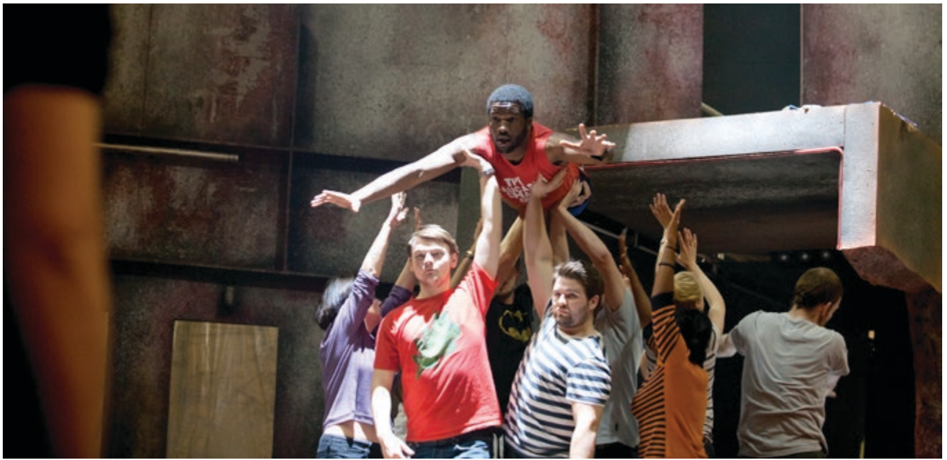
Pericles at the RSC (2012), courtesy of the company