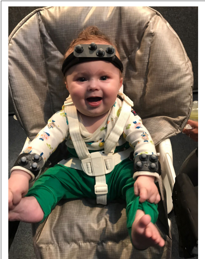
FIGURE 2 | Motion tracking systems allow for precise tracking of infant's limb or head movement. The position of light reflecting spheres attached to the infant body is triangulated with the help of a system of surrounding cameras. This system is light and does not interfere with infant's movements.

modified in response to new auditory input provided by the cochlear implant' (p. 892).