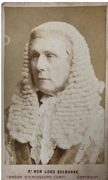
Figure 4. Rt. Hon. Lord Selborne. The studio logo on the back of the CdV is in a style used by the studio between 1880 and 1885. He held that office for a second time from 1880-1885. He is shown here in judicial robes worn by a Lord Chancellor.

The cartes figures 1, 3 and 4 all come from one of the most prolific studios; the London Stereoscopic and Photograph Company. 10 Like those that appear in the