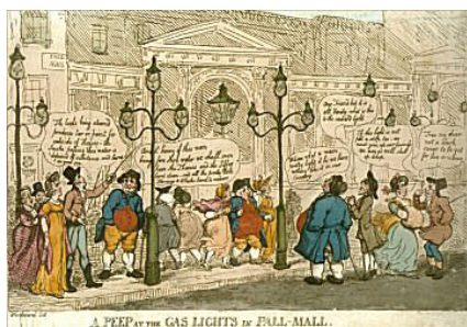
Fig 2. Thomas Rowlandson, A Peep at the Gas-Lights in Pall-Mall

The most important form of distancing or abstraction was the separation of light from combustible matter. Jonathan Crary has suggested that the 1820s saw the situation of vision within the body as a physiological event. 14 If this is true, then the artificial light supplied by gas seemed like a kind of autonomous vision, a harsh