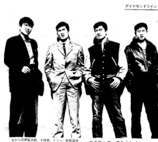
Figure 2. Nikkatsu’s ‘Diamond Line’ poster. From left to right: Yūjirō Ishihara, Akira Kobayashi, Akagi Keiichirō and Koji Wada.

While the jidaigeki films leading the ‘kimono effect’ in the West were a failure in Japan, these taiyōzoku films obtained great success at the box office. The three Nikkatsu films, Season of the Sun , Crazed Fruit and Backlight raised ¥500 million; Punishment Room and Summer in Eclipse made around ¥150 million each (Namba 2004, p. 165). Media pressure exerted by the American stars must have been especially intense between 1952 and 1957, a period in which the distribution of foreign films in Japan doubled, rising from 63 to 118 (Vv 1963, 35), and the assimilation of these Hollywood codes continued in the films including a juvenile star system created by Nikkatsu in the following years featuring: Yūjirō Ishihara, Akira Kobayashi, Keiichirō Akagi, Kōji Wada and Joe Shishido (see Figure 2), representing a new Japaneseness embodying disconcerting hybrids between Japanese and foreign heroes.