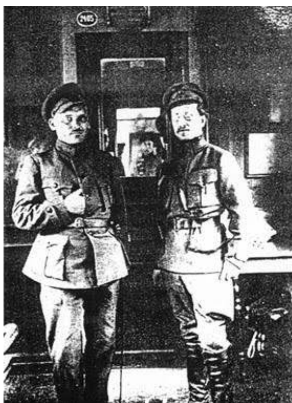
Fig. 2: Grigor'ev and Antonov-Ovseenko, Znamianka, April 1919

these reports were all sent to the Bolshevik Central Committee, the Party leadership continued to depend on Grigor'ev in the hope “that his military strength might be put to use,” as Commander of the Ukrainian Soviet Army, Antonov-Ovseenko, put it. 42 As late as May 2, 1919, Antonov-Ovseenko dispatched a confidential memorandum to the Soviet government, advising it to maintain close cooperation with Grigor'ev, even praising him as “a local man” who has “always stood up against the oppressors of the peasantry.” While acknowledging Grigor'ev's unpredictability, Antonov-Ovseenko asserted: “it should be quite possible to keep him under control.” 43