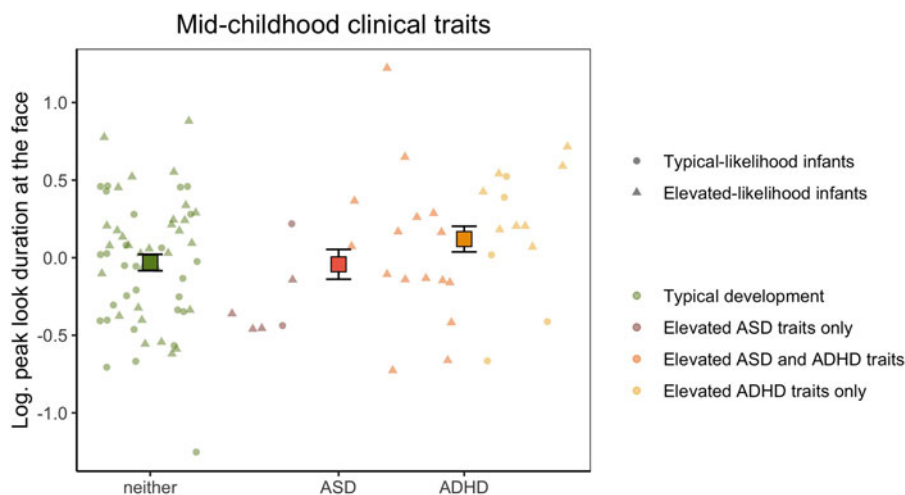
Figure 4. Mean peak look duration at the face for infants with typical development and children with elevated autism spectrum disorder (ASD) or attention-deficit hyperactivity disorder (ADHD) traits in mid-childhood. The peak look duration values presented on the y-axis are log-transformed and adjusted for the effect of number of valid trials and age. Error bars represent \pm 1 standard error of the mean. All individual data are represented by points (elevated-likelihood of ASD and/or ADHD (EL) or triangles (typical likelihood of ASD and/or ADHD (TL) and color-coded based on whether the infant had typical development (green), scored above the ASD threshold only in the parent-report questionnaire (brick), scored above the ADHD threshold only in the parent-report questionnaire (yellow), or scored above the threshold for both ASD and ADHD (orange) at 6 years of age.

significant when including Phase as covariate ( F(1,87) = 4.202, p = .043, \eta_p^2 = 0.046 ). Longer peak look duration at the face was observed in infants who later showed elevated ADHD traits ( F(1,88) = 6.401, p = .013, \eta_p^2 = 0.068 , with Phase as covariate: F