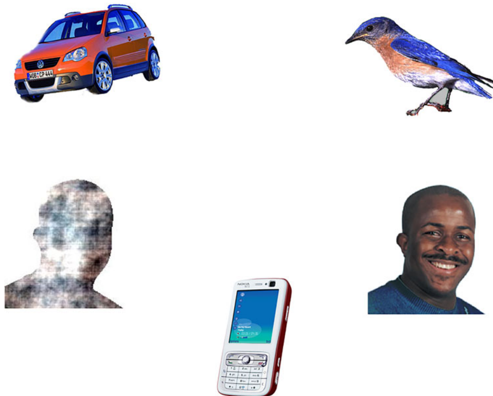
Figure 1. Example of one slide containing an array of five stimuli presented during the face pop-out eye-tracking task.

EL: elevated likelihood of autism spectrum disorder (ASD) and/or attention-deficit hyperactivity disorder (ADHD) based on familial history of first-degree family members, TL: typical likelihood of ASD and/or ADHD based on familial history of first-degree family members, N = number of participants or trials, SD = standard deviation, MSEL: Mullen Scales of Early Learning.