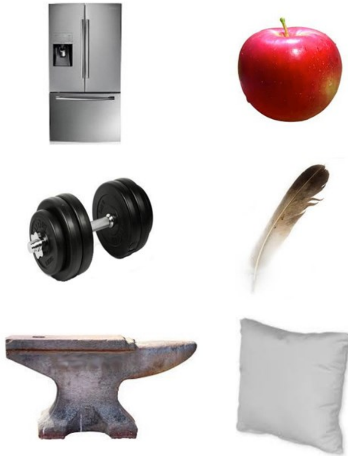
Figure 1: Examples of the type of images used, representing six of the categories we used (clockwise from top-left): refrigerator, apple, barbell, feather, anvil, and pillow. The categories were chosen to reflect a broad range of sizes, weights, and degrees of hardness. Due to copyright restrictions, the actual images used cannot be displayed here, but these images are representative.