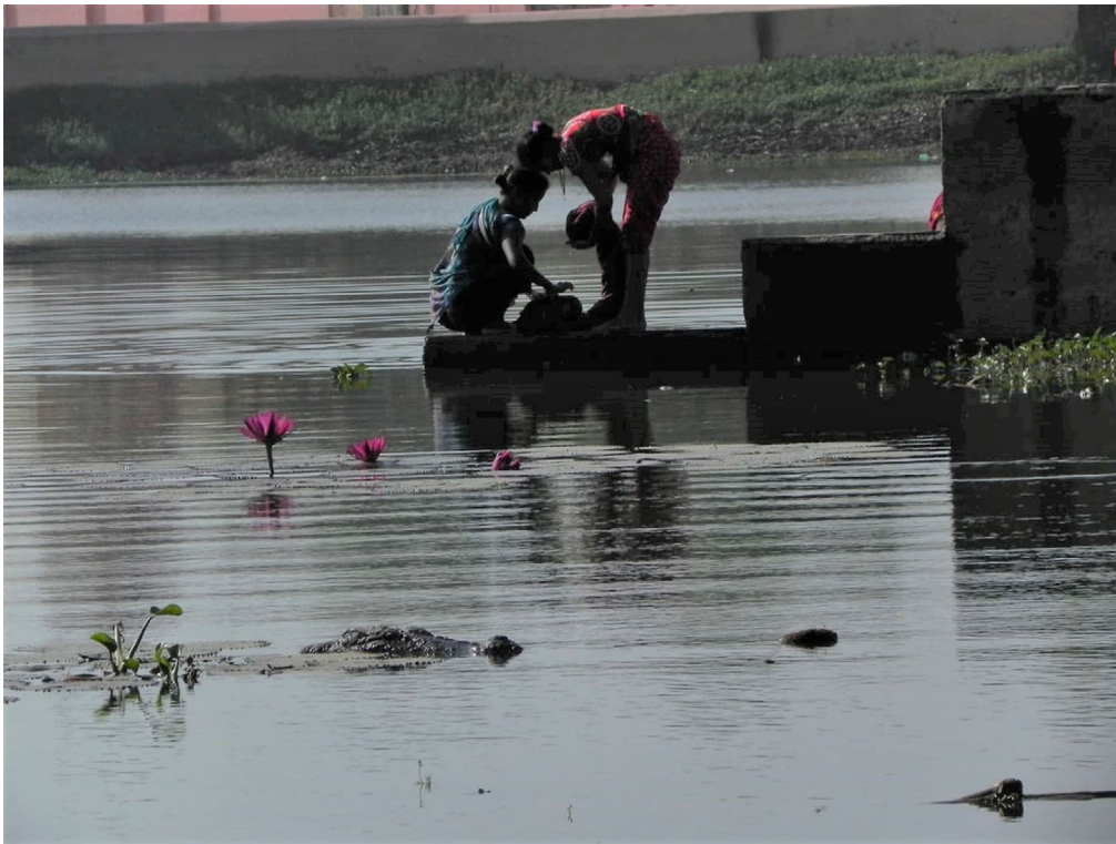
Figure 1. Women washing near a mugger in a village pond in Anand District, Gujarat, India.