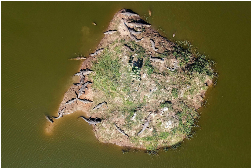
Figure 2. Muggers basking safely on an island created for them in Deva Village pond, Anand District, Gujarat.

perceptions of population trends; extent and nature of shared use of waterbodies; attacks on people or livestock; apparent differences in the behavior of muggers (mostly) resident in ponds and dams (where coexistence exists) compared with river mugger (where most