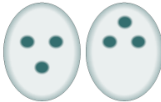
Figure 3. Schematic illumination of the stimuli that might be optimal for activating the hypothesized subcortical route. Such a configuration is optimal for face-detection from a distance, as well as for eye contact detection in close-up. Reproduced from Johnson, M. H. (2005). Subcortical face processing. Nature Reviews Neuroscience , 6, 766-774., with permission.

It has been proposed that the sub-cortical route is also responsible for face preferences in newborn infants in whom the cortical visual pathways are only poorly functioning (Johnson, 2005b). Current work is investigating the extent to which the optimal stimuli for eliciting face preferences in newborns are similar to those that maximally activate the adult sub-cortical route (Figure 3) (Farroni et al., 2005; Johnson et al., 1991).