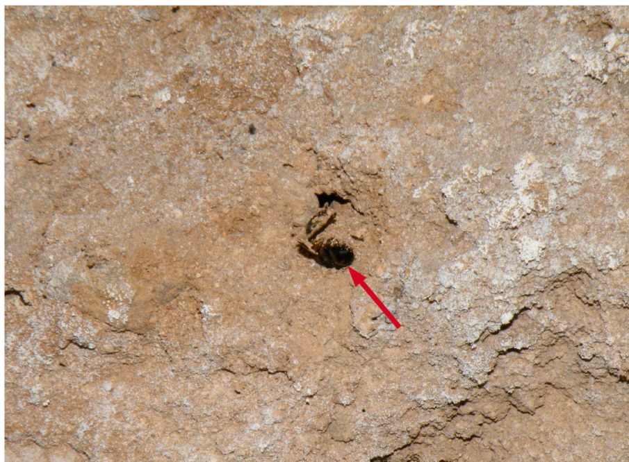
Fig. 2. Solitary bee excavating a burrow on the section wall of our trench in Shanidar Cave photographed September 4, 2022. The bee has broken through a whitish efflorescent crust into slightly-consolidated sediment behind. The insect is head-down in the burrow, spraying loose sediment out of the hole with her legs. Her abdomen is arrowed.

To produce mixed clumps of pollen, another mechanism than straightforward deposition of flowers (whether by Neanderthals or by burrowing birds) must have been operating. The most likely is that the pollen was accumulated by nesting solitary bees. The pollen loads of