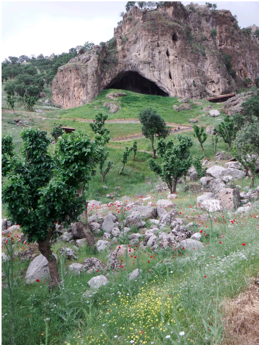
Fig. 1. Wild flowers at Shanidar Cave, photographed May 5, 2023.

The 'Flower Burial' (Shanidar 4) was found in 1960. During this season, Solecki dug a 7.4 m deep cut on the western side of the main trench in order to recover the postcranial skeleton of Shanidar 2, and deepened a second cut below the find-spot of Shanidar 1 on the eastern side of the trench. On the 31st July, excavation at the find-spot of Shanidar 3 on the east side of the trench found further parts of this skeleton.