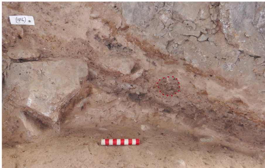
Fig. 6. Ancient rodent burrow in the trench wall, less than 1 m stratigraphically below and approximately 4 m to the East of the location of Shanidar 5, photographed in September 2018. Scale measures 10 cm, looking South. Burrow outlined by a dashed red line. (For interpretation of the references to color in this figure legend, the reader is referred to the Web version of this article.)