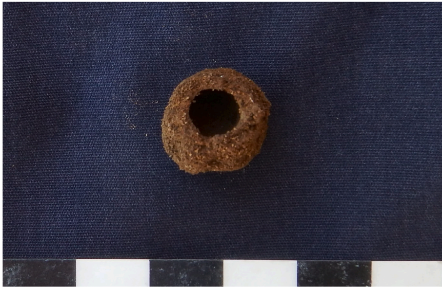
Fig. 3. Ancient silty clay-lined insect burrow excavated from sediments about 1.5 m below the position of Shanidar Z, photographed in May 2023. The fill in this specimen was virtually unconsolidated and fell out on the short walk and drive from the cave to the dig house. Scale in cm.

individual bees can contain more than one species if they are foraging different species at once (e.g. Free, 1970 ; Ramalho et al., 1994 ).