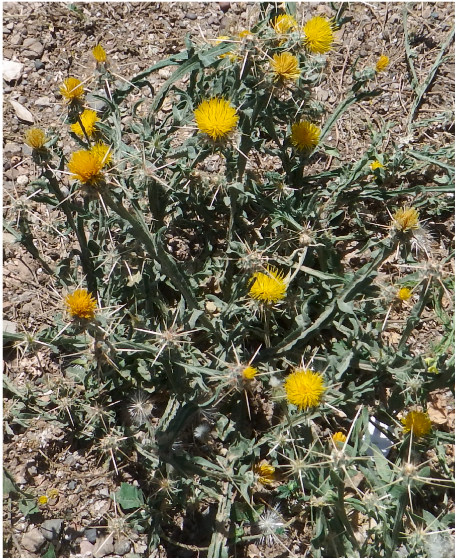
Fig. 8. Centaurea solstitialis photographed May 27, 2022 in the valley below Shanidar Cave, showing the spiky flower-heads.

the fragmentary skeletal material found below them was from another placed individual. This is consistent with members of their group(s) feeling empathy (Pomeroy et al., 2020a, 2020b). It has become clear from the work of the Shanidar Cave Project that several bodies in the Shanidar 4 cluster were placed episodically, close to what would have been a major landmark on the cave floor - a very large boulder over 2 m high when the bodies were deposited. The episodic, repeated deposition of Neanderthal bodies within a very confined space, as evidenced by the Shanidar 4 group, seems to be worthy of further consideration and debate.