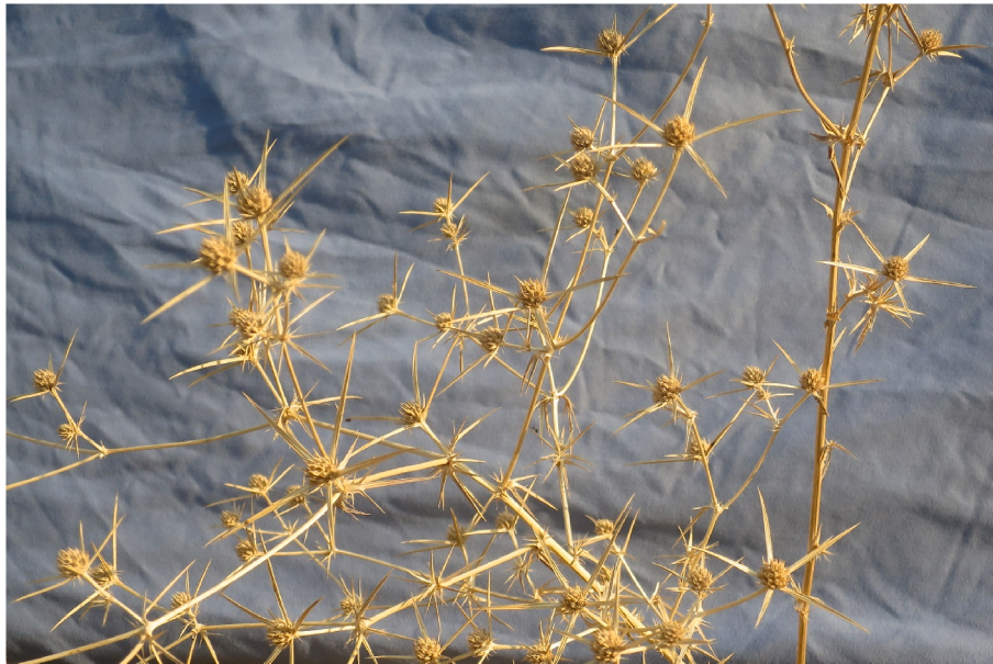
Fig. 9. Centaurea solstitialis seed heads photographed in September 2022.

that some clumps contained immature pollen might suggest more complex scenarios.