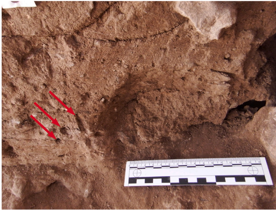
Fig. 5. Ancient insect burrows (arrowed) in the trench wall, in deposits ~15 cm below the location of Shanidar Z and very close to the level of new, unpublished, fragmentary Neanderthal remains, photographed in May 2022. The sandy fill of the middle burrow is particularly apparent. Looking North, scale measures 15 cm.

level have been illuminated by artificial light, whereas it would seem from his accounts of the excavations (e.g. Solecki, 1961, 1971) that Solecki did not use artificial light while he was excavating. It is thus quite likely that he was unable to see bee burrows in his excavations at depth, as in the Shanidar 4 zone. Bee burrows could, however, be felt by the current excavation team while trowelling, so Stewart, who excavated around Shanidar 4, might have noticed them even if he could not see them.