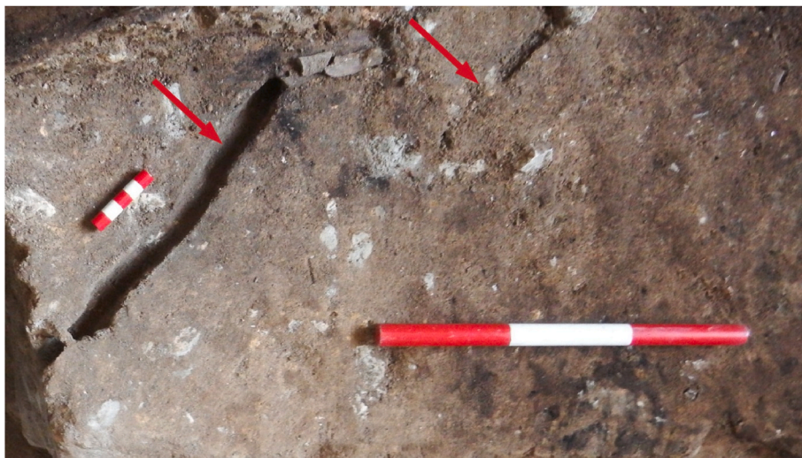
Fig. 4. Modern (red arrow to left) and ancient clay-lined (red arrow to right) insect burrows in deposits about 1 m west of the position of Shanidar 4, photographed in September 2022. Vertical photo; East to top of image, larger scale measures 30 cm, small scale in cm. (For interpretation of the references to color in this figure legend, the reader is referred to the Web version of this article.)

In our current excavations at the site, some probably-ancient mud-lined sub-horizontal and sub-vertical bee burrows have been found close to the location of Shanidar 4, Shanidar Z (discovered 2016, see Pomeroy et al., 2020a ) and some fragmentary Neanderthal skeletal remains below Shanidar Z. Modern bee burrows also appeared between our excavation seasons ( Fig. 4 ). It is also worth noting that our recent excavations at this