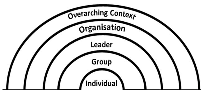
Figure 2: The IGLOO Model