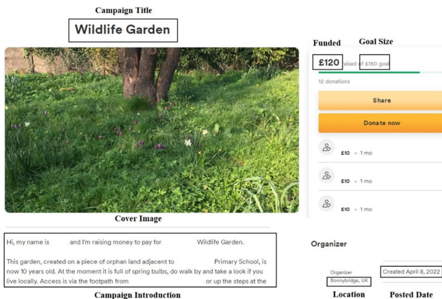
Fig. 1 Information collected from gofundme webpage (an example)

This section presents the data collection methods, processing, and hypothesis testing. We extracted data from the GoFundMe website using web crawling (see Fig. 1). Textual processing and computer vision techniques were used to process raw data. Finally, using the successful (funded smoothly) and failed (failed to get funds as raised money = 0) green crowdfunding campaigns as samples, we undertook logistic regression analysis to examine the proposed hypotheses.