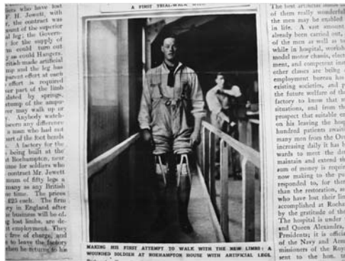
Fig. 5. Illustrated London News, 16 October 1915, p. 498: 'Making his first attempt to walk with the new limbs: A wounded soldier at Roehampton House with artificial legs'.