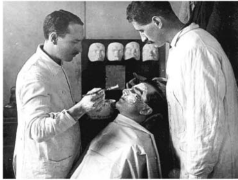
Fig. 6. Horace Nicholls, Repairing War's Ravages: Renovating facial injuries . Applying the first coat of plaster for the purpose of taking the mould of patient's face, who has been blinded in one eye. The patch is to restore that side of the face which has been disfigured.