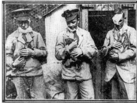
Petting before potting—the men take much interest in the rabbits.