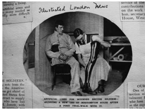
Fig. 4. Illustrated London News , 16 October 1915, p. 498: 'Artificial limbs for wounded British soldiers: adjusting a new leg at Roehampton House after a first trial-walk with it'.