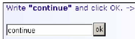
Figure 3: “Continue” text box in RELOAD

The “continue” box just described achieves the same behaviour as a “Continue” button. When the user has finished an activity and wants to advance to the next one the word continue must be entered in the text box, and then press “OK”. Figure 3 shows the look-and-feel of the box in the RELOAD IMS-LD player 2 .