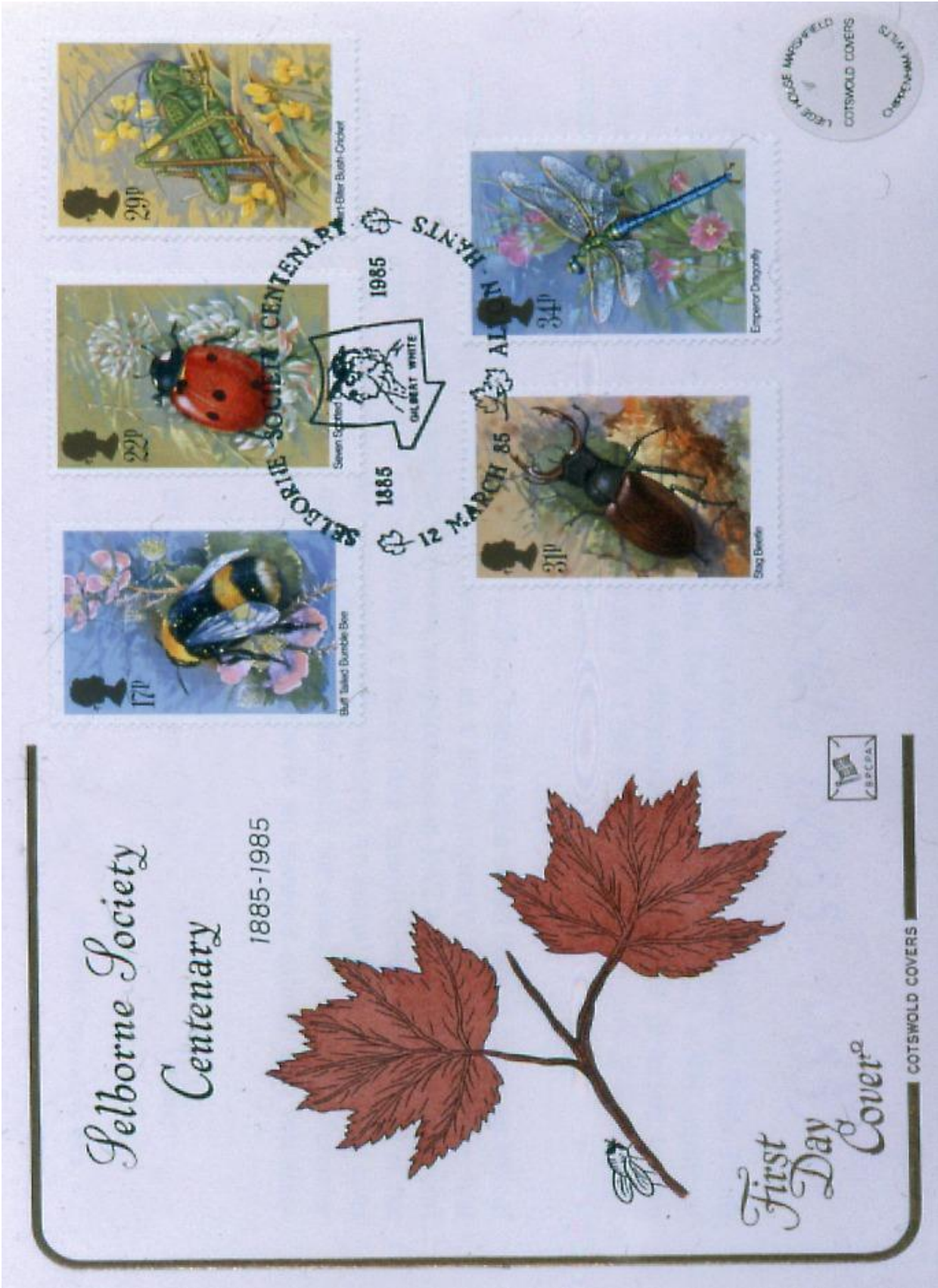
Fig 5. The Selborne Society's Centenary Cover (1985)