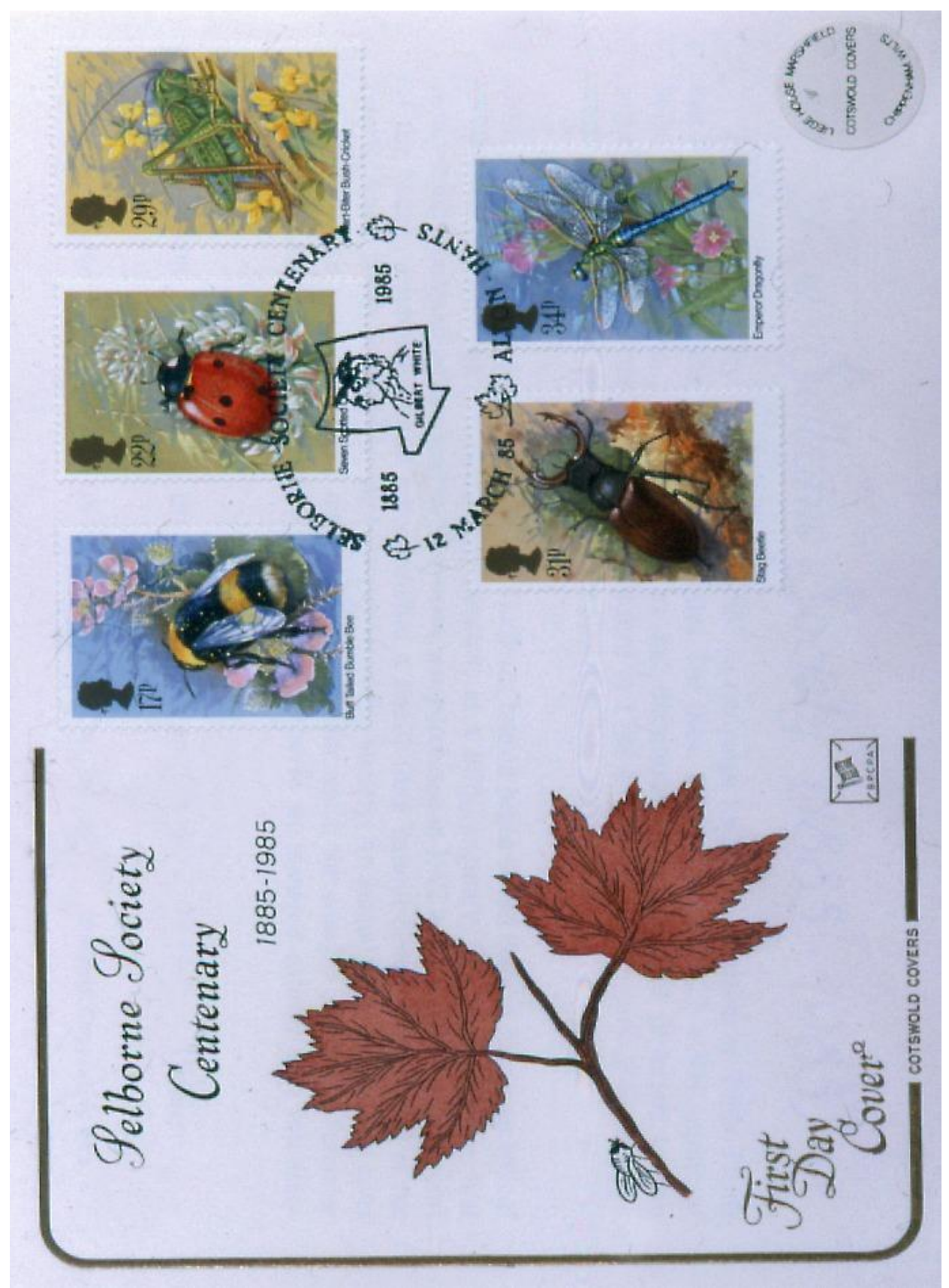
Fig 5. The Selborne Society's Centenary Cover (1985)